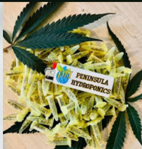
FEMINIZED SEEDS $50.00 (10 PACK)