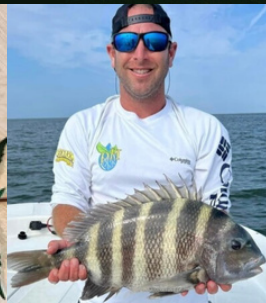
pH PFG SHIRT $49.00