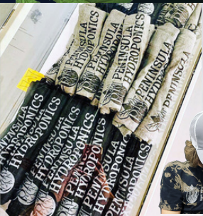
pH SHIRT $20.00