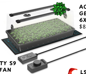
AC INFINITY GERMINATION KIT W/LED, 6X12 CELL TRAY $89.99