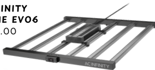
AC INFINITY IONFRAME EVO6 $559.00