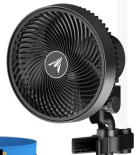
AC INFINITY S9 9" CLIP FAN $59.99