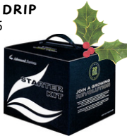
ADVANCED NUTRIENTS STARTER KIT $217.95