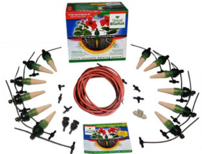
BLUMAT IRRIGATION KIT 12 SENSOR DRIP $149.95