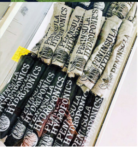
pH SHIRT $20.00