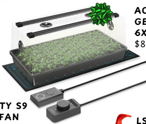
AC INFINITY GERMINATION KIT W/LED, 6X12 CELL TRAY $89.99