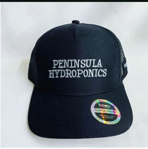
pH HAT $20.00