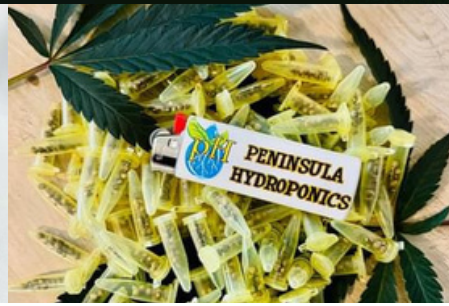
FEMINIZED SEEDS $50.00 (10 PACK)