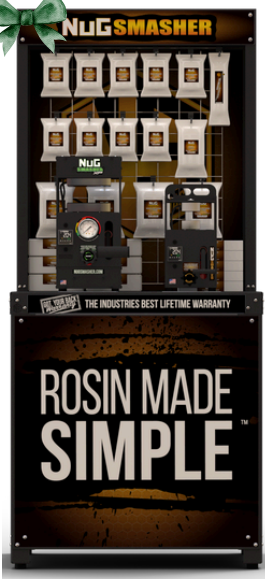
NUGSMASHER MINI & XP $656.00 - $1996.00