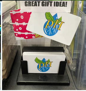
pH GIFT CARD