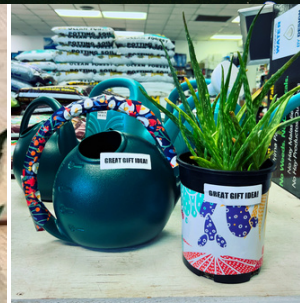
WATERING CAN $14.99 - $17.35 ALOE PLANT: $5.00 - $15.00