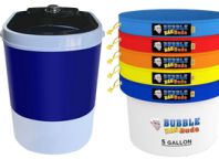
BUBBLEBAGDUDE BUBBLE MACHINE 5 GALLON W/ 5 BAG KIT $179.99