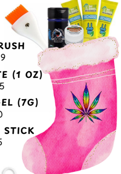
GREAT WHITE (1 OZ) $14.95